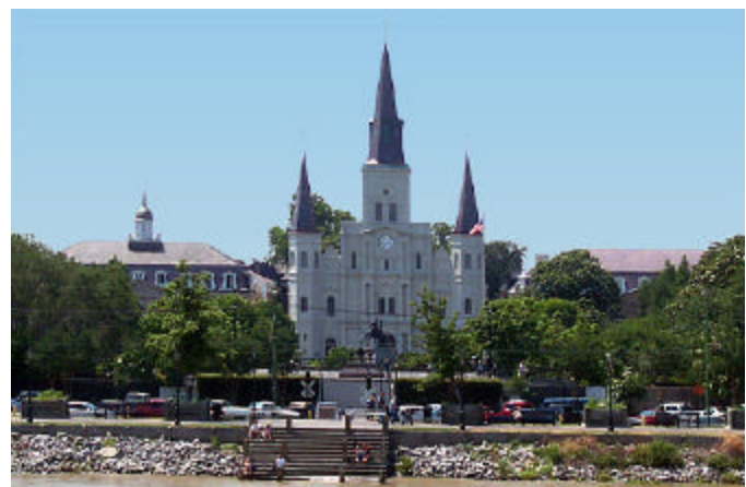
Saint Louis Cathedral, New Orleans