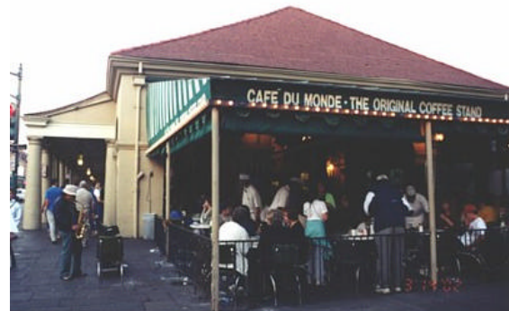
Café Du Monde, New Orleans Famous for Coffee and Beignets