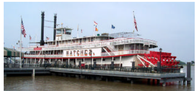
Natchez Riverboat, New Orleans